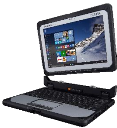
TOUGHBOOK 20 10.1" Windows detachable