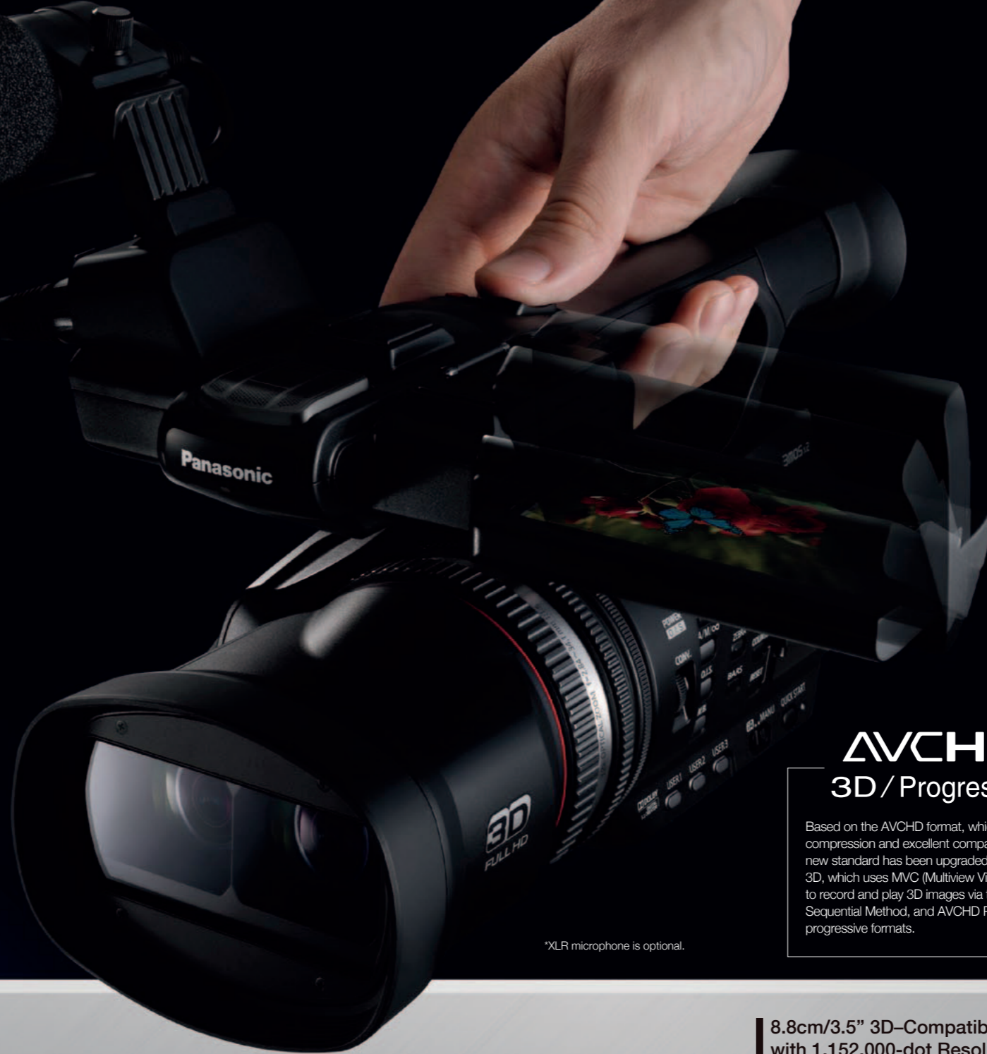
*XLR microphone is optional.